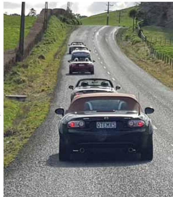
headed off in various directions home. 🌀

We are all looking forward to the next twelve months worth of adventures in our MX5's. So following our lunch with lots of good cheer and friendship we