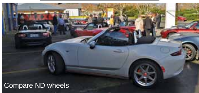
Compare ND wheels