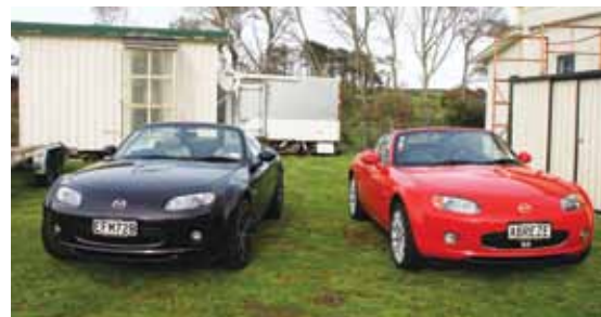
Our Leaders RED MX5