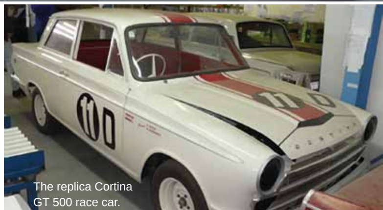
The replica Cortina GT 500 race car.