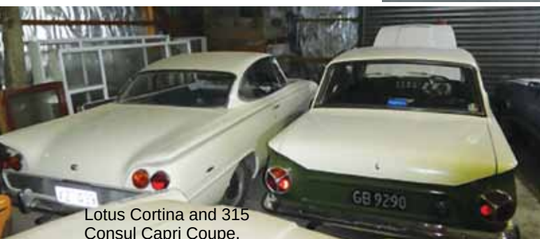
Lotus Cortina and 315 Consul Capri Coupe.