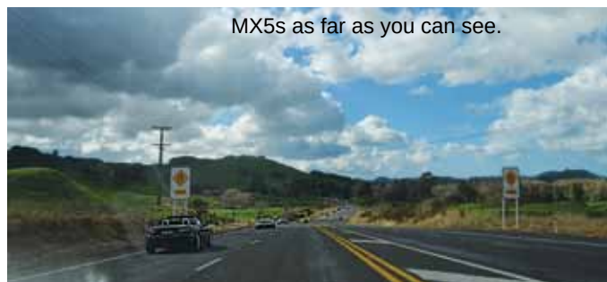
MX5s as far as you can see.

ways in various directions after another great MX5 day out.