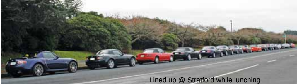
Lined up @ Stratford while lunching

Sunday Morning we all met at the 'Inflame Café' on Main Street, Eltham at 9.30ish for morning tea and a chat. After an hour or so 16 MX5's moved off and followed Neil through the countryside to Hunter Road and the "all things Fire Brigade Collection" of Denis