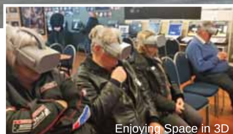
Enjoying Space in 3D

When everyone had had their fill of the Space Centre we headed towards home, stopping for a last Coffee at Stoked Eatery in Te Kuiti. Couldn't do much about the weather, but otherwise a grand day was had by all. 🌦