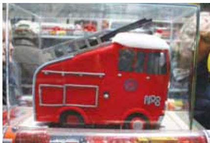
Thou shalt never be eaten