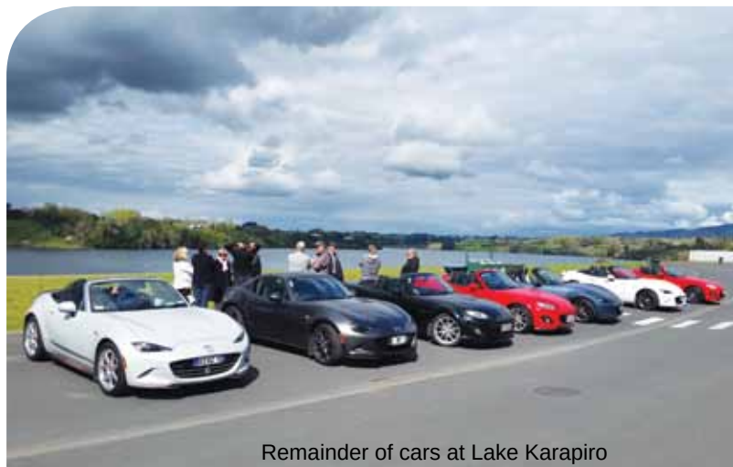
Remainder of cars at Lake Karapiro

WAIKATO RUN: 30 SEPTEMBER 2018 // REPORT BY DAVE BARLOW