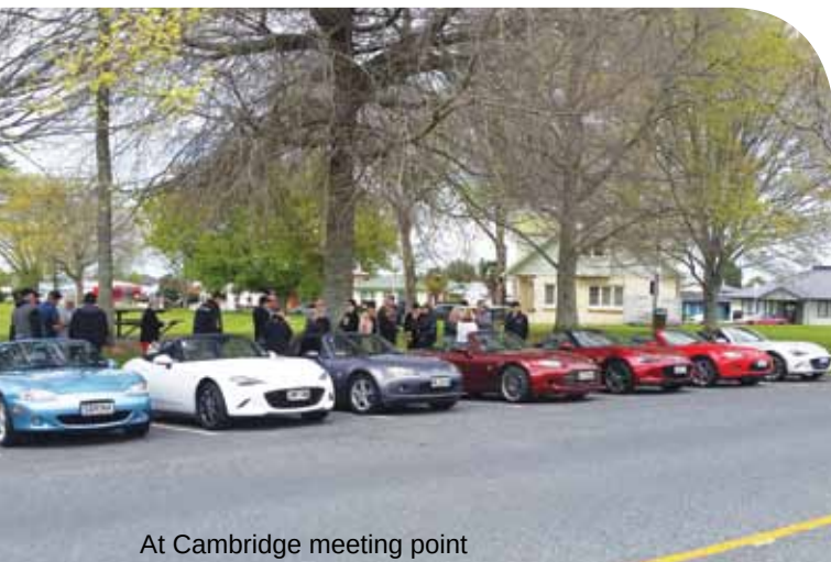
At Cambridge meeting point