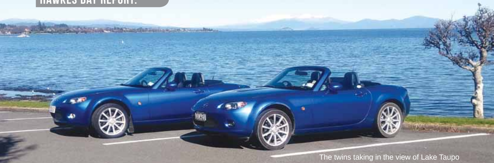
The twins taking in the view of Lake Taupo