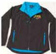
Geneva Jacket 2020 - Men $90.00