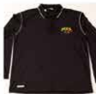
Hype Polo Long Sleeve 2020 - Women $45.00