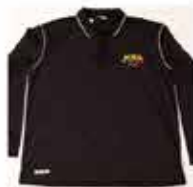
Hype Polo Long Sleeve 2020 - Men $45.00