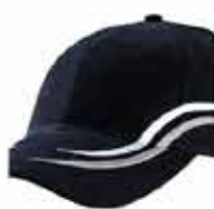
30th Anniversary Club Cap $25.00