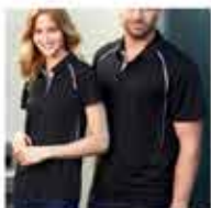
Hype Polo Short Sleeve 2020 - Men $46.00