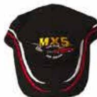
Club Cap 2020 $25.00