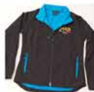
Geneva Jacket 2020 - Women $90.00