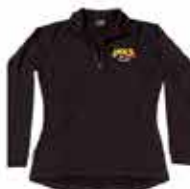
Merino Zip Polo 2020 $125.00