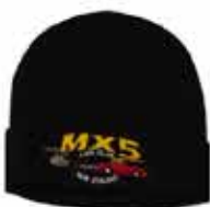
Club Beanie 2020 $25.00