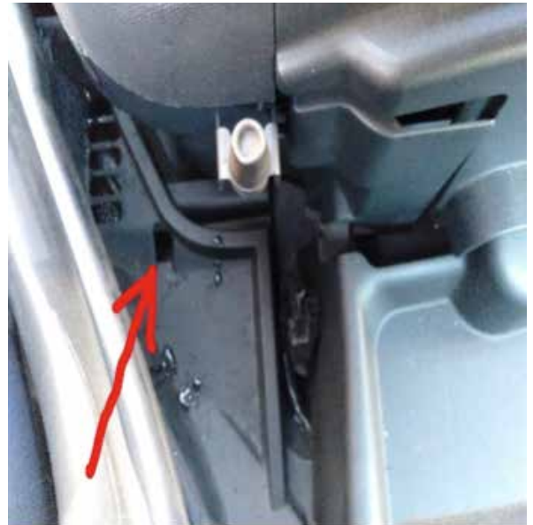
Above: LH drain hole. Below: RH drain hole.

It is also worth checking the underside of the sills to make sure the water drains are OK. In the NC these have plastic covers to prevent water from splashing up into the sill. However, the covers can get damaged, stopping the water from draining out. ●