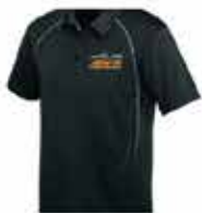
30th Anniversary Polo - Women $40.00