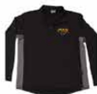
Transition Top 2020 $65.00