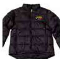
Puffer Jacket 2020 $100.00