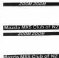
Number Platte Surround - Silver Fern $15.00

The Club is pleased to announce we have a new range of 30th anniversary clothing available.