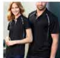
Hype Polo Short Sleeve 2020 - Women $46.00