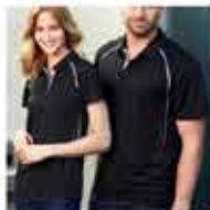
Hype Polo Short Sleeve 2020 - Men $46.00