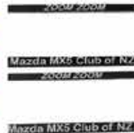
Number Plate Surround - Silver Fern $15.00

The Club is pleased to announce we have a new range of 30th anniversary clothing available.