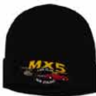
Club Beanie 2020 $25.00