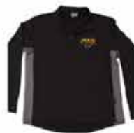
Transition Top 2020 $65.00