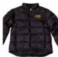
Puffer Jacket 2020 $100.00