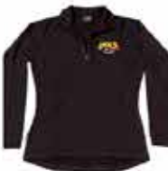
Merino Zip Polo 2020 $125.00