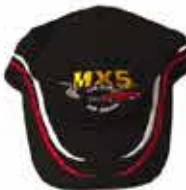
Club Cap 2020 $25.00