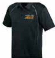
30th Anniversary Polo - Men $46.00